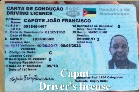
Caput Driver's license