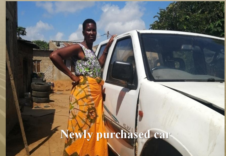
Newly purchased car