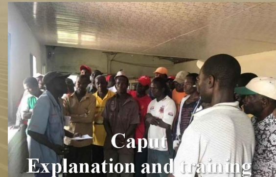
Caput Explanation and training